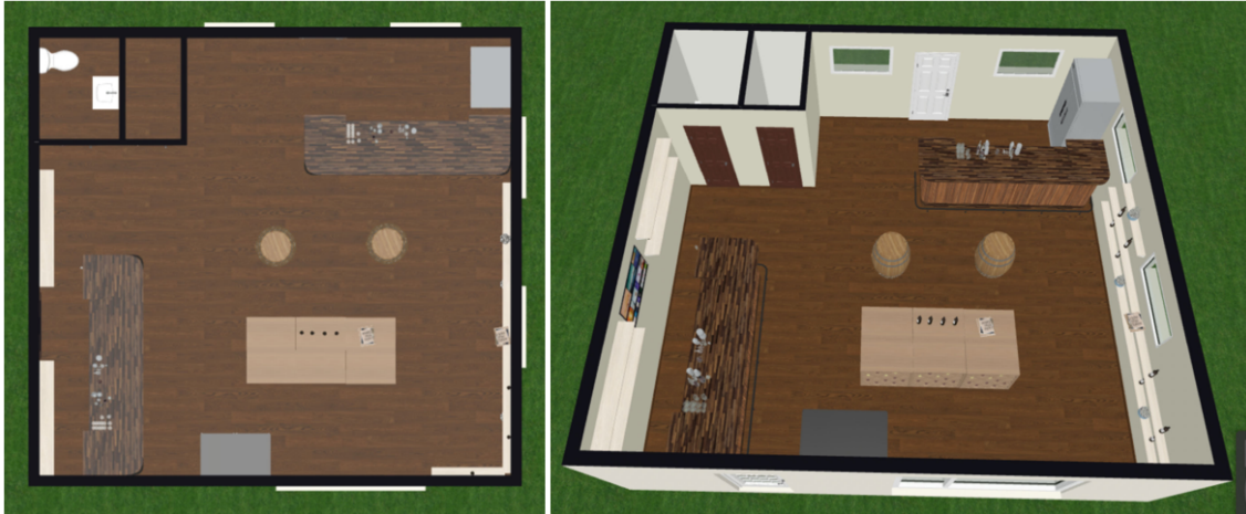
Figure 1 The left is the top down view of the floor plan. The counters shown are remaining from the previous business.