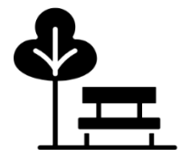
Parks & Recreation